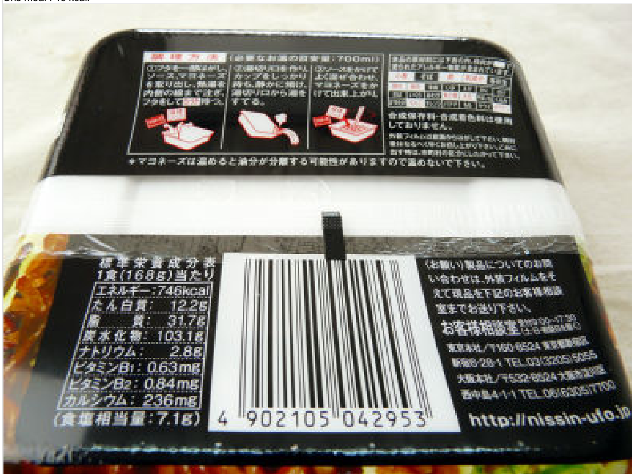
U.F.O. Male Dojo is recruiting dojo studentsIt seems to be.