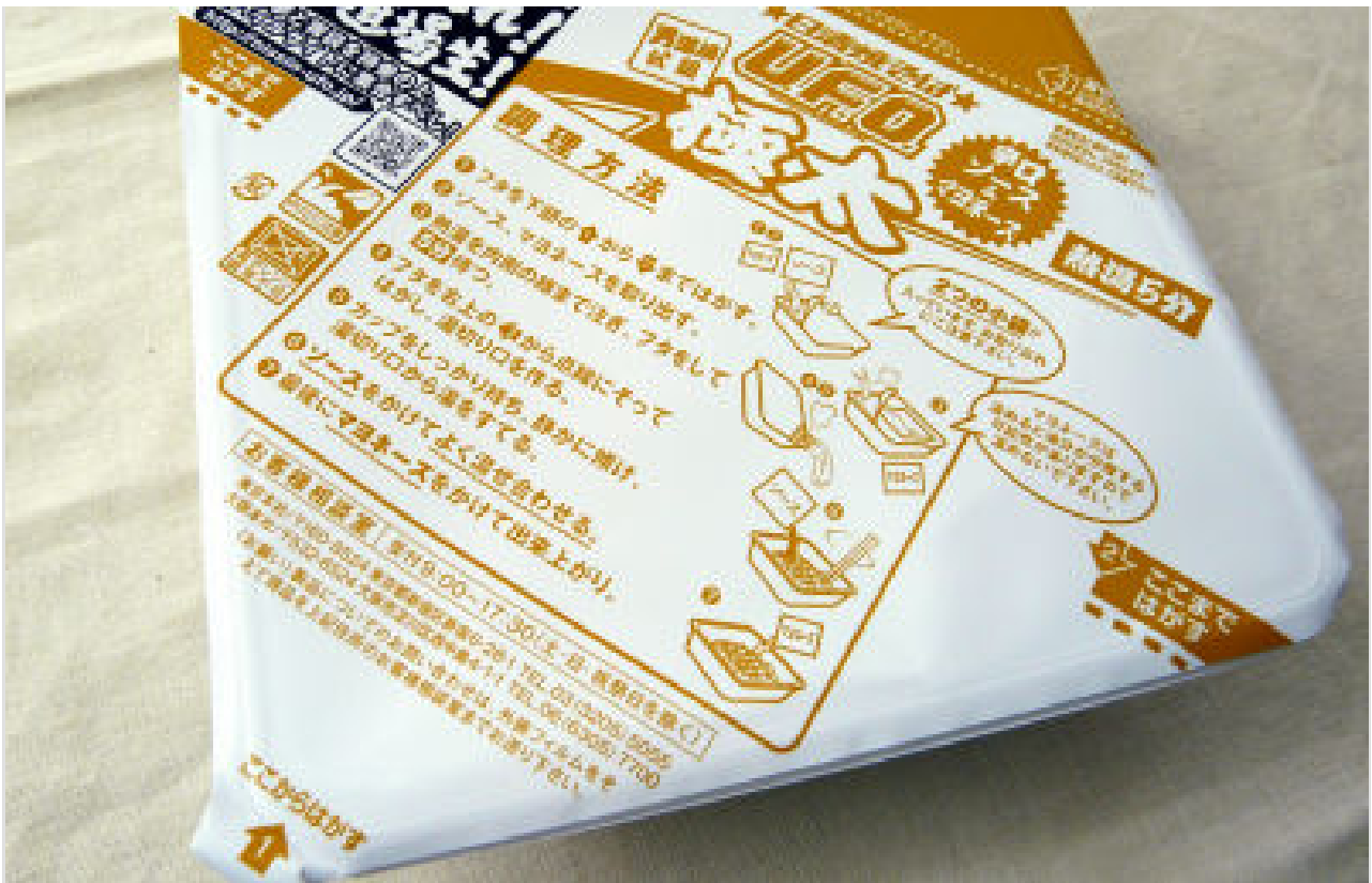
Two sachets, liquid sauce and mayonnaise.